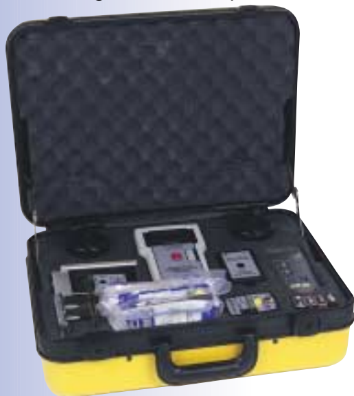
Desco's ESD Survey Kit, Item No. 19000

The Jewel™ Mini Monitor continuously monitors the integrity of one operator and an ESD protective work surface's discharge path to ground. The Monitor will provide virtually instantaneous notification of static control equipment failures, eliminating the need of periodic testing and costly record keeping. This unit is highly cost effective as it is designed to monitor any conventional single conductor wrist strap and ground cord system. There are no additional wires to connect and its small package makes it highly suitable to install on a worksurface. And since it is a Jewel™, it is available in your choice of 5 colors - Sapphire, Ruby, Topaz, Emerald, and Amethyst.