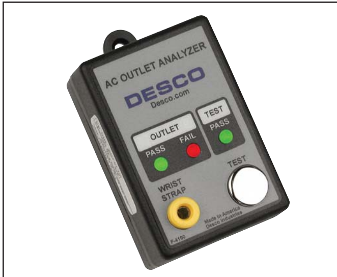
Figure 1. Desco 98130 AC Outlet Analyzer and Wrist Strap Tester